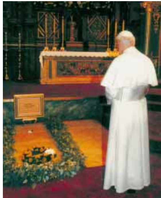
Pope John Paul II at Serra's tomb at Mission San Carlos Borromeo, 1987.

After the hearings at Carmel, the Cause officials moved on to San Francisco for a